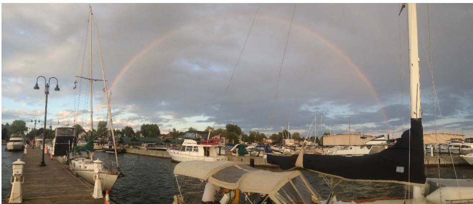
Photo 1-A rainbow appears over the Junior Sailing fleet in Clayton, NY.

This may have been one of the more memorable Junior sailing seasons thus far! Several events took place this summer (not all of them planned) that included many of those seeking their sea legs. The summer began with an exciting number of new Junior Sailors and coaches learning all about our classroom boats and the art of sailing.