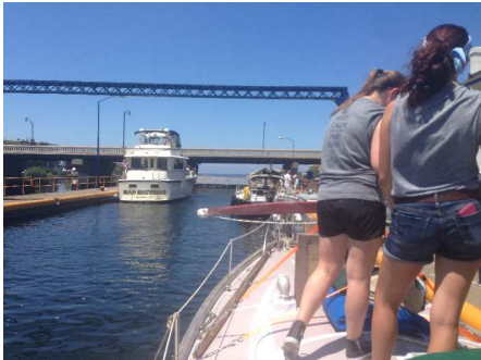
Photo 3-Junior Sailors enter the last lock in Oswego, NY before arriving at Lake Ontario.

MacBlane had the experience of a lifetime cruising the great lake and learning from multiple on-the-fly situations. These crews navigated the canals, traveled through locks, and did a few remarkable sails on Lake Ontario. Seek Ye First and Tomfoolery first sailed from Oswego to Sodus Point, 25 nautical miles upwind in 4-5 foot seas, building to 6 feet, in 20 knots of wind, without any problems. Two days later, the two